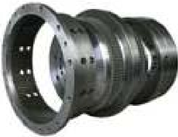
WA series multi disc clutch/brake unit. Air actuated wet running. Clutch torque up to 85,000 Nm Brake torque up to 30,000 Nm