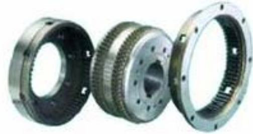
WO series multi disc clutch/brake unit. Oil actuated wet running. Clutch torque up to 630,000 Nm Brake torque up to 120,000 Nm