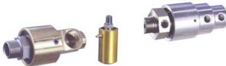
Rotating union for high pressure oil