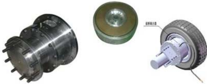
Front axle Hydraulic brake