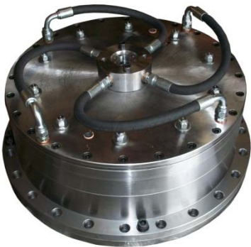
FI series multi disc clutch. Oil actuated, spring released. Clutch torque up to 500,000 Nm