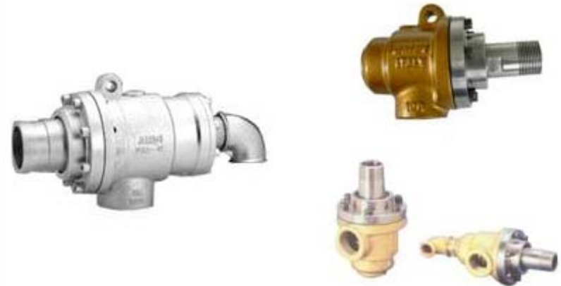
Rotating union for water and steam