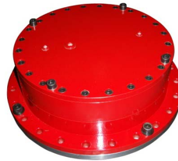
BI series multi disc brake. spring actuated, oil released wet running. Brake torque up to 250,000 Nm

Special painting for marine applications