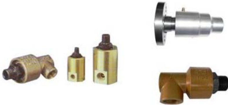
Rotating union for air pressure